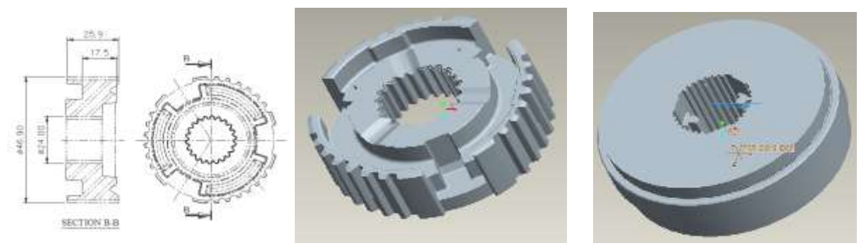
Figure 3.1: Sketch & 3D Model of compacting tool

In the following, we outline the principle procedure of designing a compacting tool. As a Representative example, we choose a part having two parallel holes and two portions of different height as shown in fig.3.1. Based on the technical drawing of this structural part, a proportionally correct sketch of the tool is being developed from which the required functions of the various tool members can be understood. Subsequently, exact dimensions and tolerances for all tool members are being established. Eventually, adequate tool materials as well as machining- and heat-treating procedures are being considered.